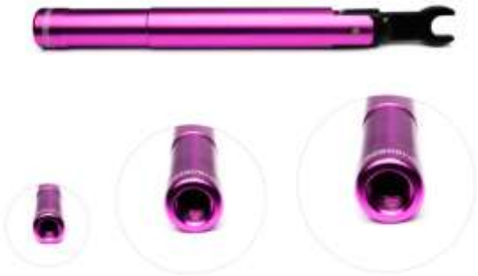
SMA TORQUE WRENCH Part No. SZP19B281637